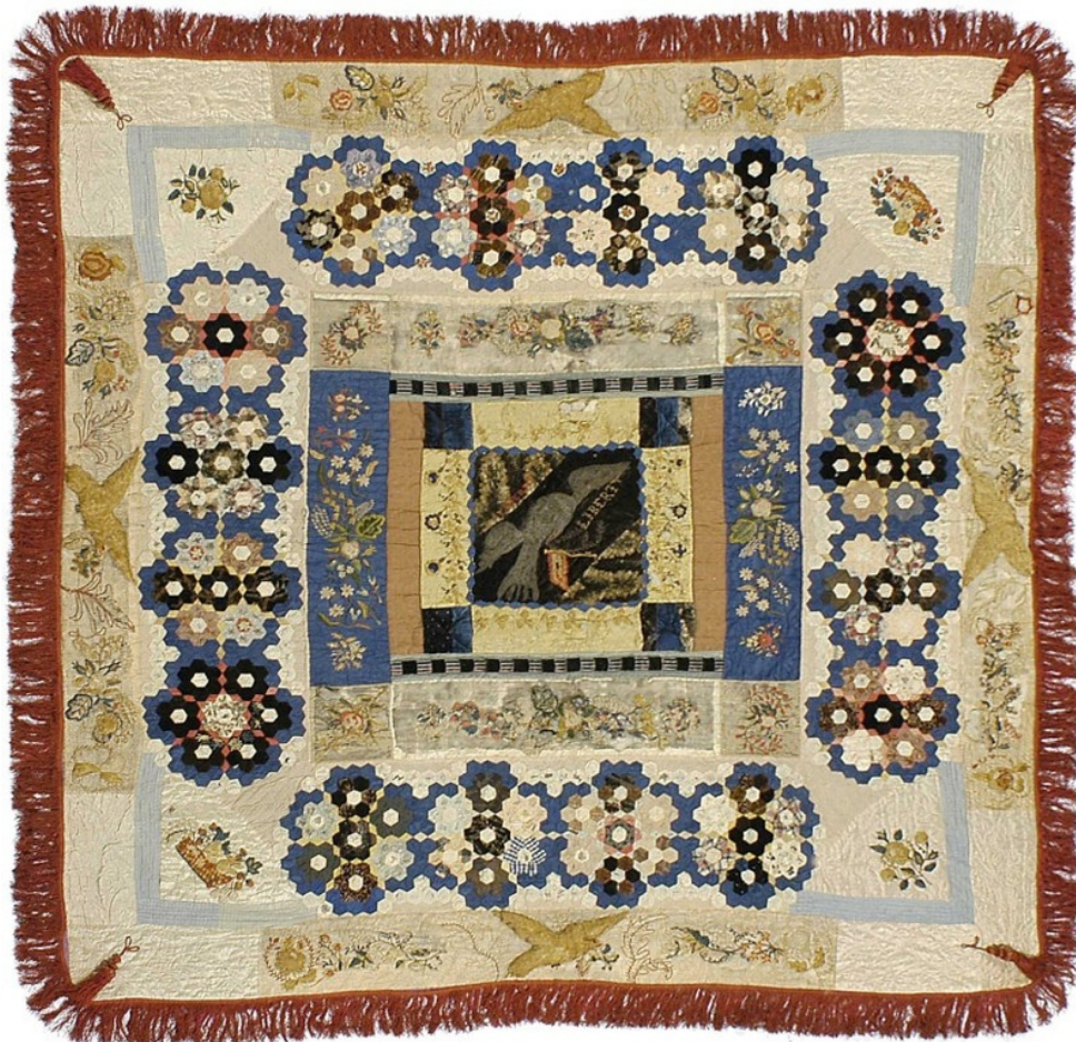
Elizabeth Keckley’s quilt

Elizabeth’s book survives, as do some of the dresses she made for Mary Lincoln, which are on display at the National Museum of American History in Washington, D.C. What also survives is the quilt she made from scraps of Mary Lincoln’s old dresses. It can be viewed today at the Kent State University Museum in Kent, Ohio.